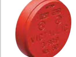
No. 60 End Cap 3/4" - 24" | DN20 - DN600 Submittal 07.01