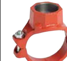
STYLE 920(N) Mechanical-T Outlet 2" - 8" | DN50 - DN200 Submittal 11.02