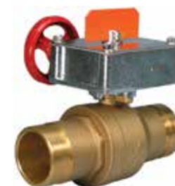
SERIES 728 FireLock™ Ball Valve 1" - 2" | DN25 - DN50 Submittal 10.17