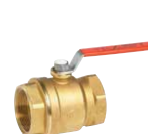
SERIES 722 Brass Body Threaded Ball Valve 1/4" - 2" | DN8 - DN50 Submittal 08.15