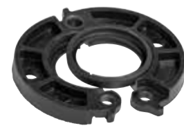
STYLE 741 Flange Adapter 2" - 12" | DN50 - DN300 N10 & PN16 Flanges Submittal 06.06