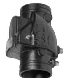
SERIES 717 FireLock™ Check Valve 2 1/2" - 12" | DN65 - DN300 Submittal 10.08