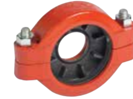
STYLE 750 Reducing Coupling 2" - 10" | DN50 - DN250 Submittal 06.08