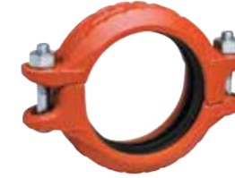
STYLE 07 Rigid Coupling 1" & 10" - 12" | DN25 & DN250 - DN300 Submittal 06.02