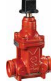
SERIES 772A FireLock™ NRS Gate Valve 2 1/2" - 12" | DN65 - DN300 Submittal 10.72