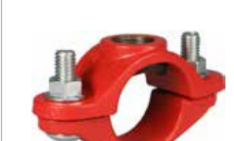
STYLE 912 FireLock™ Sprinkler Tee 1" - 1 1/2" | DN25 - DN40 Submittal 10.53