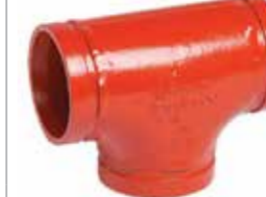
No. 002 Straight Tee 1 1/4" - 8" | DN32 - DN200 Submittal 10.03