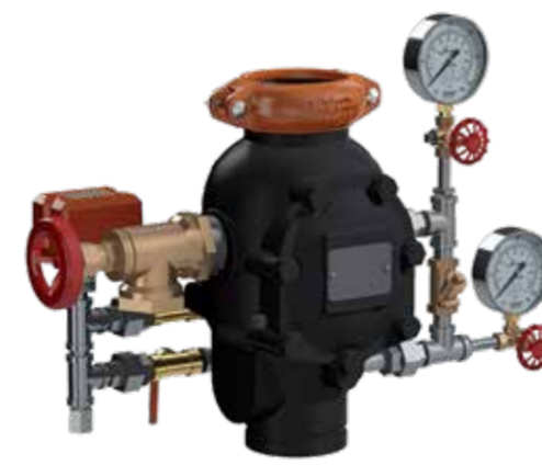
SERIES 751 FireLock™ Alarm Check Valve 1 1/2" - 8" | DN40 - DN200 Submittal 30.01