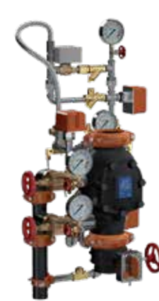
SERIES 769N FireLock NXT™ Preaction System Check Valve 1 1/2" - 8" | DN40 - DN200 Submittal 31.81