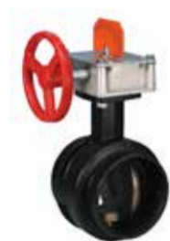
SERIES 765 FireLock™ High Pressure Butterfly Valve 2" - 12" | DN50 - DN300 Submittal 10.80