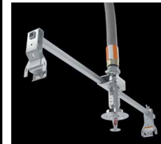
SERIES AH2 & AH2-CC Braided Hoses 31" - 72" | 790 - 1830 mm Submittal 10.85