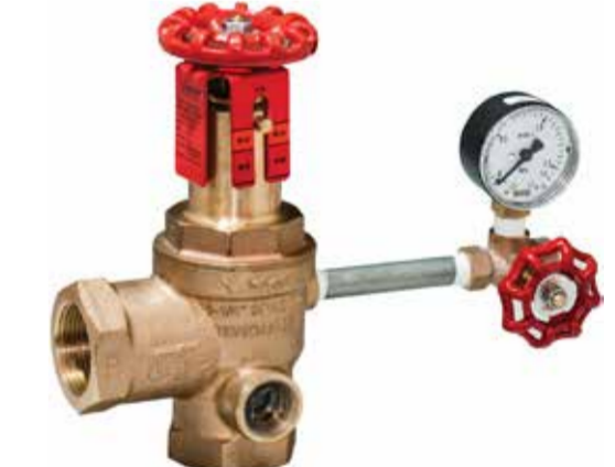
SERIES 720 Testmaster™ II Alarm Test Module 1" - 2" | DN25 - DN50 Submittal 10.22