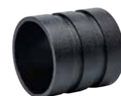
No. 143 Close Nipple 1 1/4" - 2 1/2" | DN32 - 76.1 mm Submittal 10.06