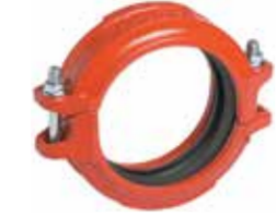
STYLE 005H FireLock™ Rigid Coupling 1 1/4" - 8" | DN32 - DN200 Submittal 10.02