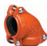
No. 101 90° Elbow 1 1/4" - 2 1/2" | DN32 - 76.1 mm Submittal 10.06