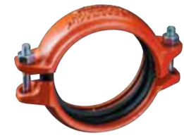
STYLE 009N FireLock EZ™ Rigid Coupling 1 1/4" - 12" | DN32 - DN300 Submittal 10.64