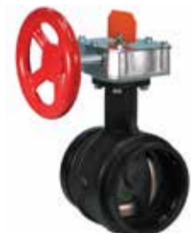
SERIES 705 FireLock™ Butterfly Valve - Supervised Open 2" - 12" | DN50 - DN300 Submittal 10.81