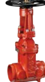
SERIES 771A FireLock™ OS&Y Gate Valve 2 1/4" - 12" | DN65 - DN300 Submittal 10.72