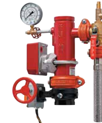
SERIES UM Universal Manifold Assembly 1 1/4" - 8" | DN32 - DN200 Submittal 30.71