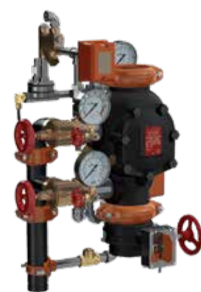
SERIES 768N FireLock NXT™ Dry System Check Valve 1 1/2" - 8" | DN40 - DN200 Submittal 31.80