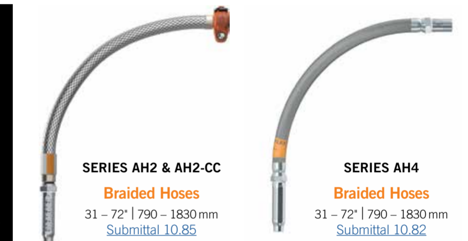
SERIES AH4 Braided Hoses 31" - 72" | 790 - 1830 mm Submittal 10.82