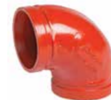
No. 001 90° Elbow 1 1/4" - 8" | DN32 - DN200 Submittal 10.03