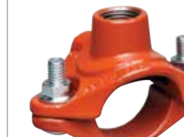
STYLE 922 FireLock™ Outlet-T 1 1/4" - 2 1/2" | DN25 - 76.1 mm Submittal 10.52