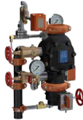
SERIES 769N FireLock NXT™ Deluge System Check Valve 1 1/2" - 8" | DN40 - DN200 Submittal 31.81