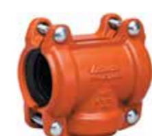
No. 102 Tee 1 1/4" - 2 1/2" | DN32 - 76.1 mm Submittal 10.06