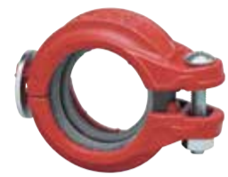
STYLE 109 One-Bolt Rigid Coupling 1 1/4" - 4" | DN32 - DN100 Submittal 10.64