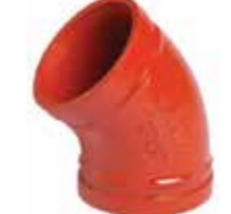
No. 003 45° Elbow 1 1/4" - 8" | DN32 - DN200 Submittal 10.03