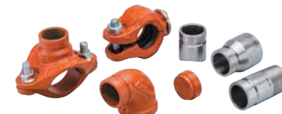
FireLock™ IGS™ Installation-Ready™ Fittings 1" | DN25 Submittal 10.54