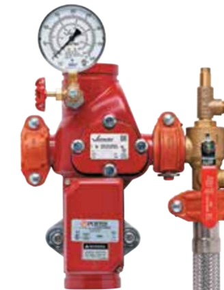
SERIES UMC Universal Manifold Check Assembly 1 1/4" - 8" | DN32 - DN200 Submittal 30.72