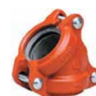
No. 103 45° Elbow 1 1/4" - 2 1/2" | DN32 - 76.1 mm Submittal 10.06